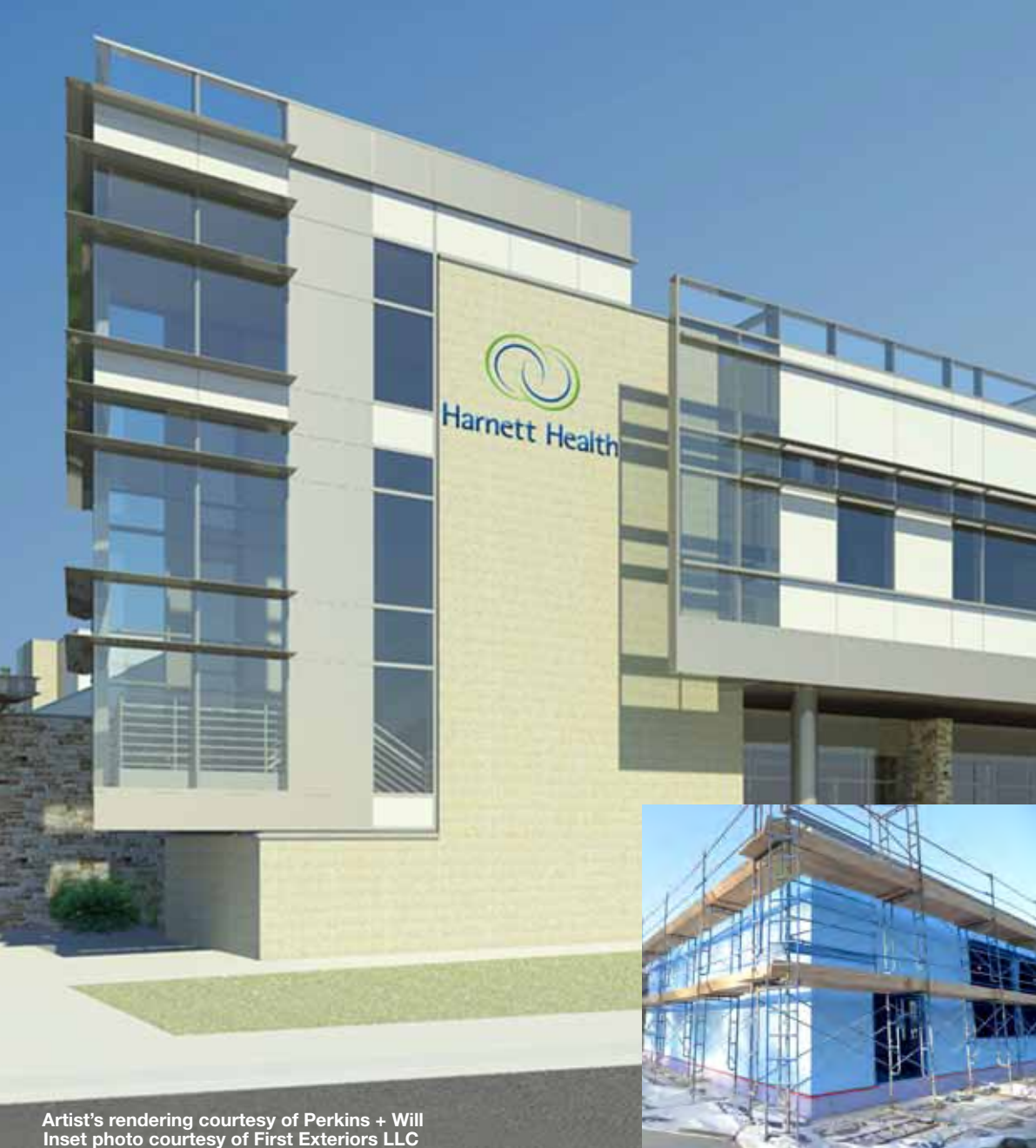
Artist's rendering courtesy of Perkins + Will Inset photo courtesy of First Exteriors LLC